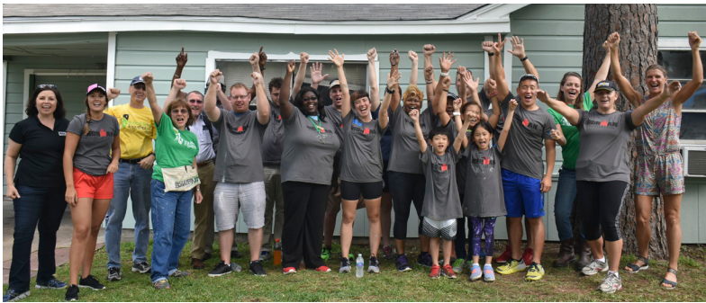
Above: Ironman Foundation; below left: Gilbane; below right: BHGRE Gary Greene